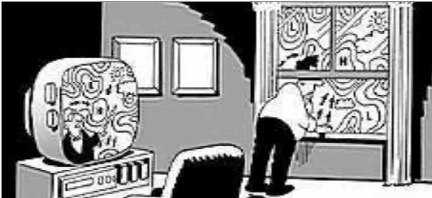
Cartoon: provenance unknown

Approved life jackets and basic boat rescue techniques – Self-rescue techniques; recognition of emergencies; the throw line; emergency towing, man overboard; getting people out of the water and to safety; and applying first aid. Ralph D.